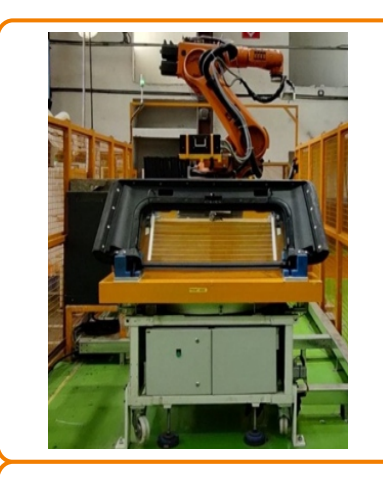
Robotic Welding Cell