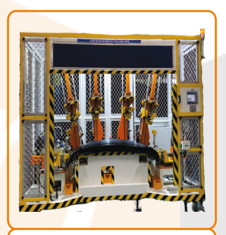
Bumper Punching Machine