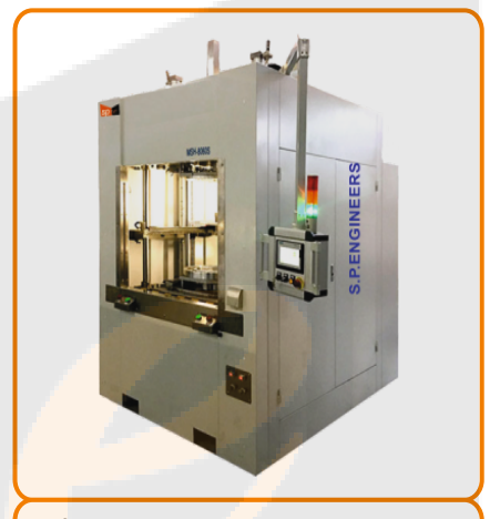
Infrared Hot Plate Welding Machine