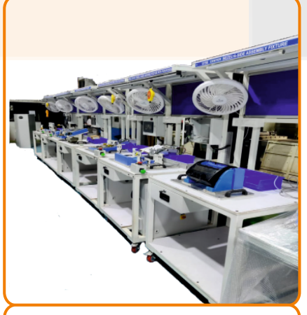
Assembly Work Station