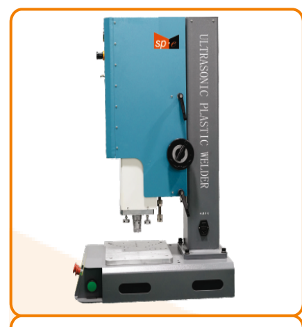
Ultrasonic Welding Machine