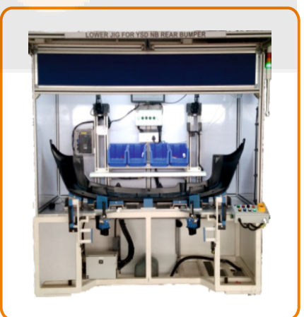
Vision Based Inspection Systems