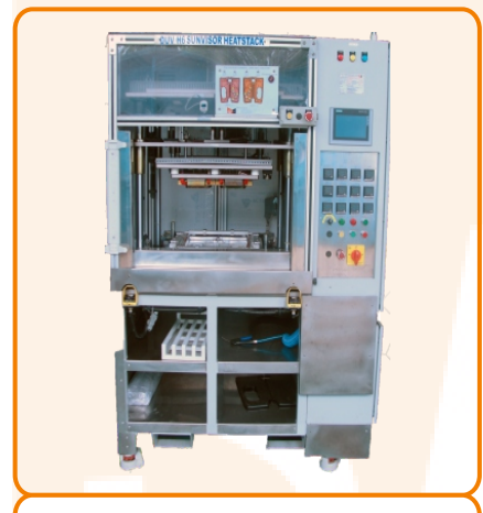
Sun Visor Heat Stack Welding Machine